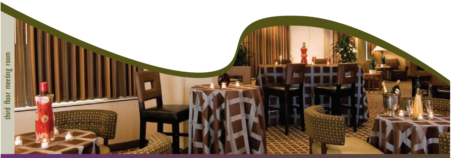
third floor meeting room